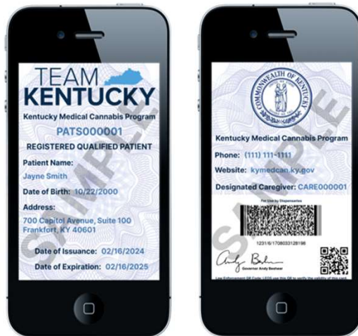
Patient registry ID Card